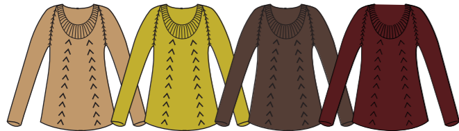
pull femme "Rita" 551