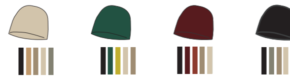
bonnet homme "Piedras" 525