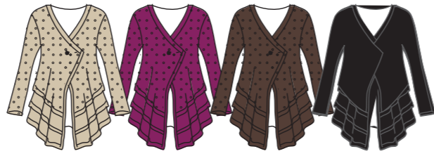
tunique large "Paloma" 545