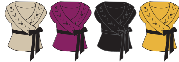
Cache Coeur "Perlina" 542