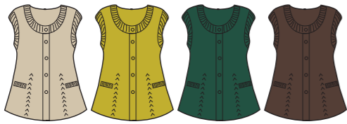
gilet court "Zora" 555