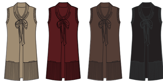
gilet long "Zalia" 556