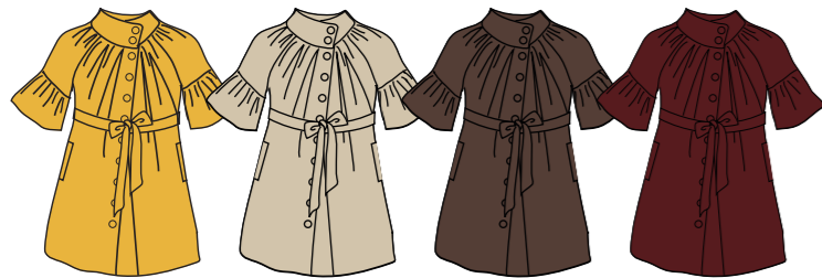
tunique "Teresa" 554