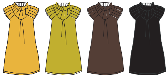
Robe "Lara" 537