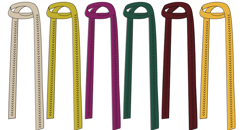
écharpe fine "Zenja" 563