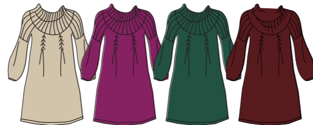
Robe "Loretta" 548