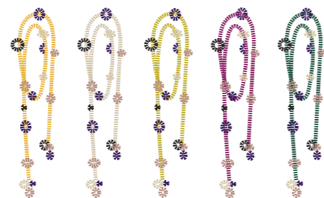
collier "Belina" 536