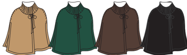
cape "Petra" 550