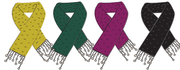
écharpe tricot main "Trinidad" 566