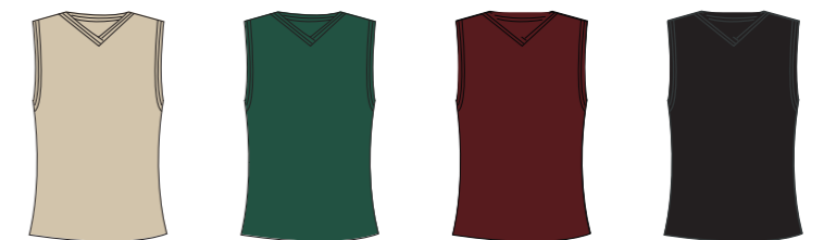
Gilet homme "Paco" 562