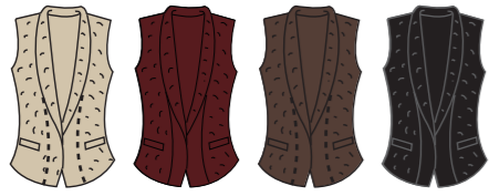
gilet tricot "Azura" 557