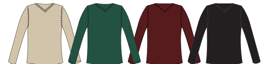
pull home "Felix" 561