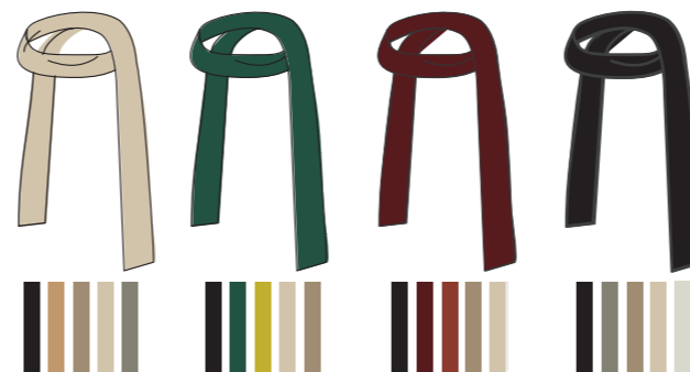
écharpe unisex "Arena" 544